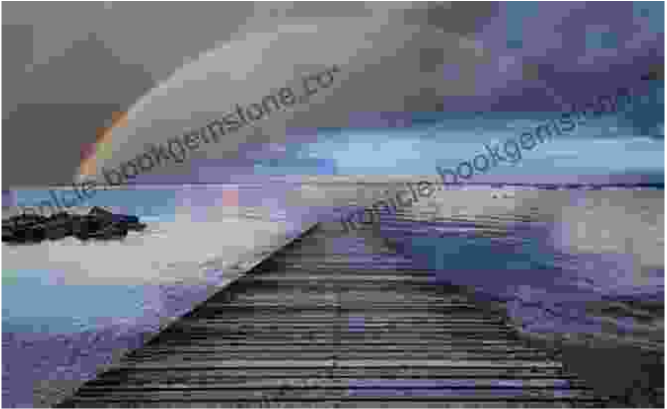
The Calm after the Storm by Lev Lagorio (1875)

This painting depicts the calm after a storm. The water is a