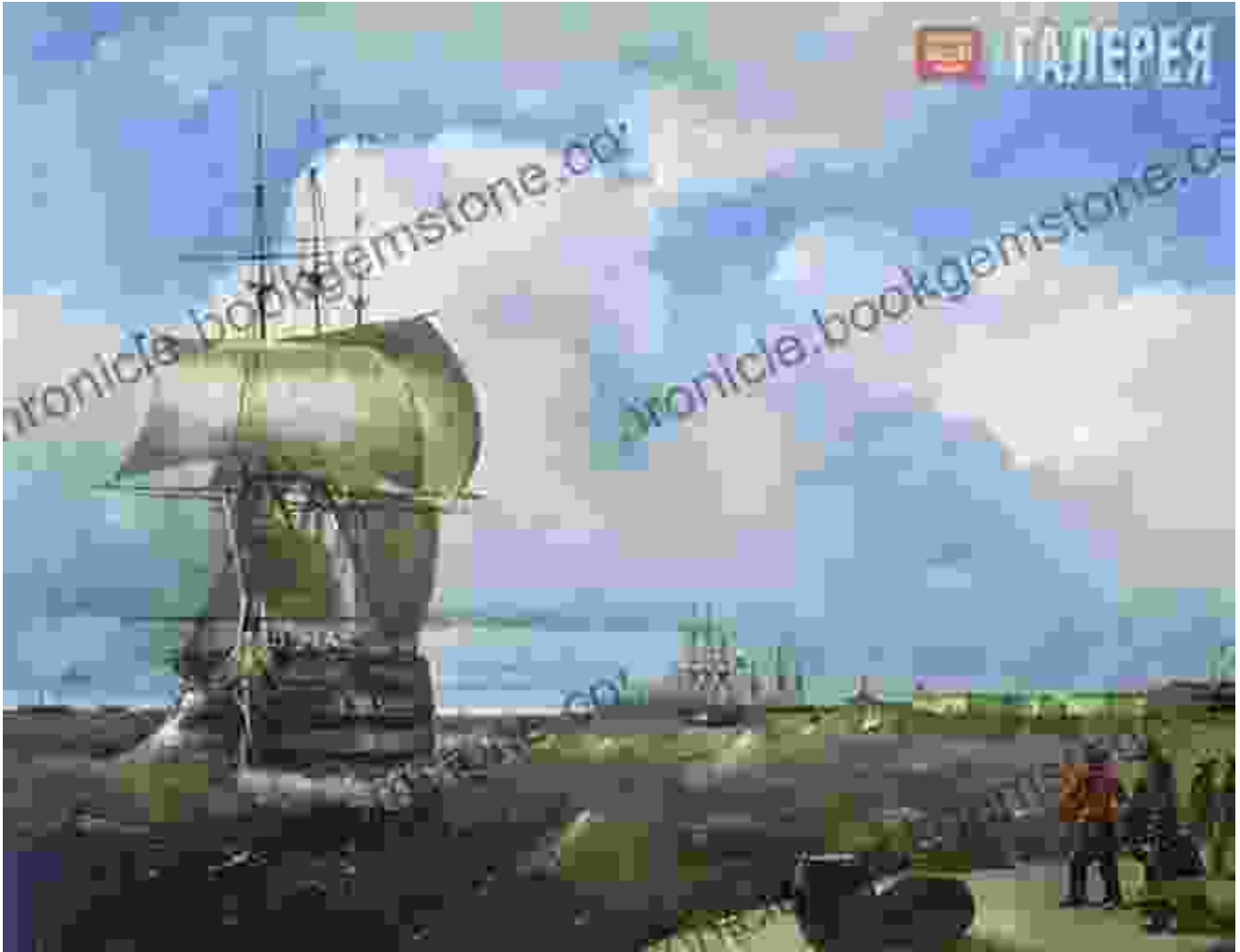
The Roadstead at Kronstadt by Lev Lagorio (1856)

This painting depicts the roadstead at Kronstadt, a naval base on the Gulf of Finland. The water is a deep blue color, and the sky is a clear blue. A number of ships are anchored in the harbor, and the fortress of Kronstadt is visible in the background. The painting is characterized by its use of vibrant colors and its attention to detail.