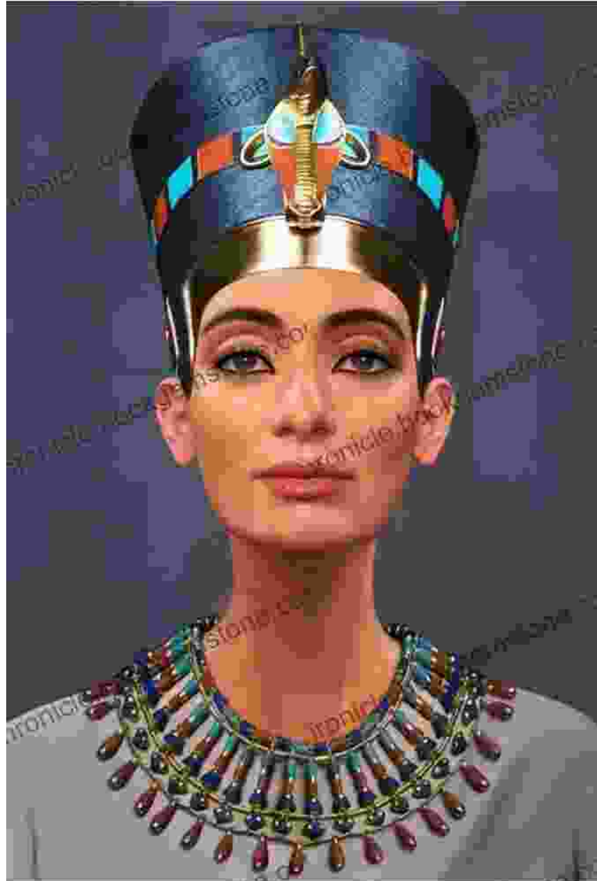
Depiction of Nefertiti, the renowned Egyptian queen