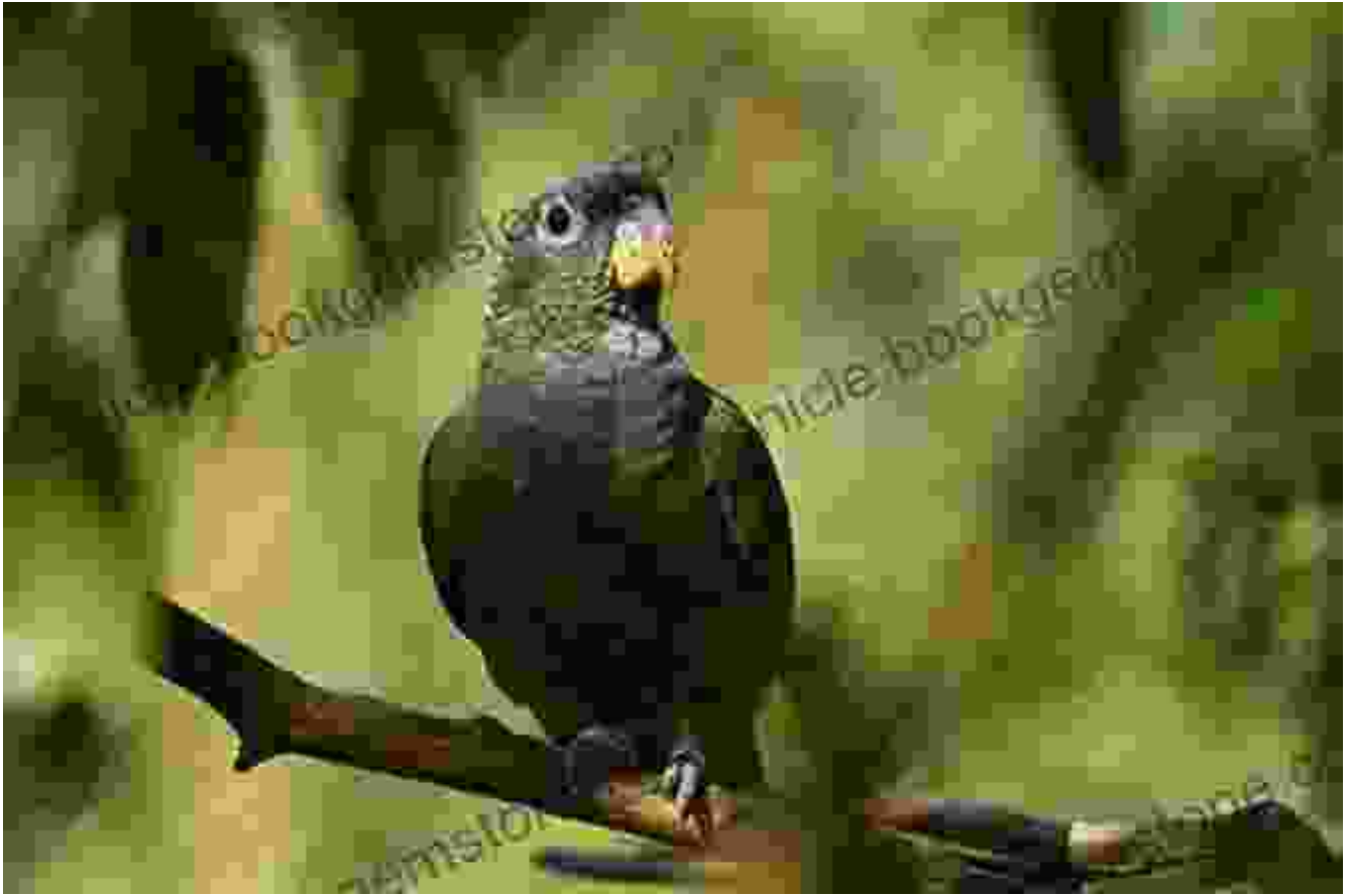
Scaly-Headed Parrot, an endangered species endemic to Grenada, its playful antics and vocalizations adding charm to the island's forests