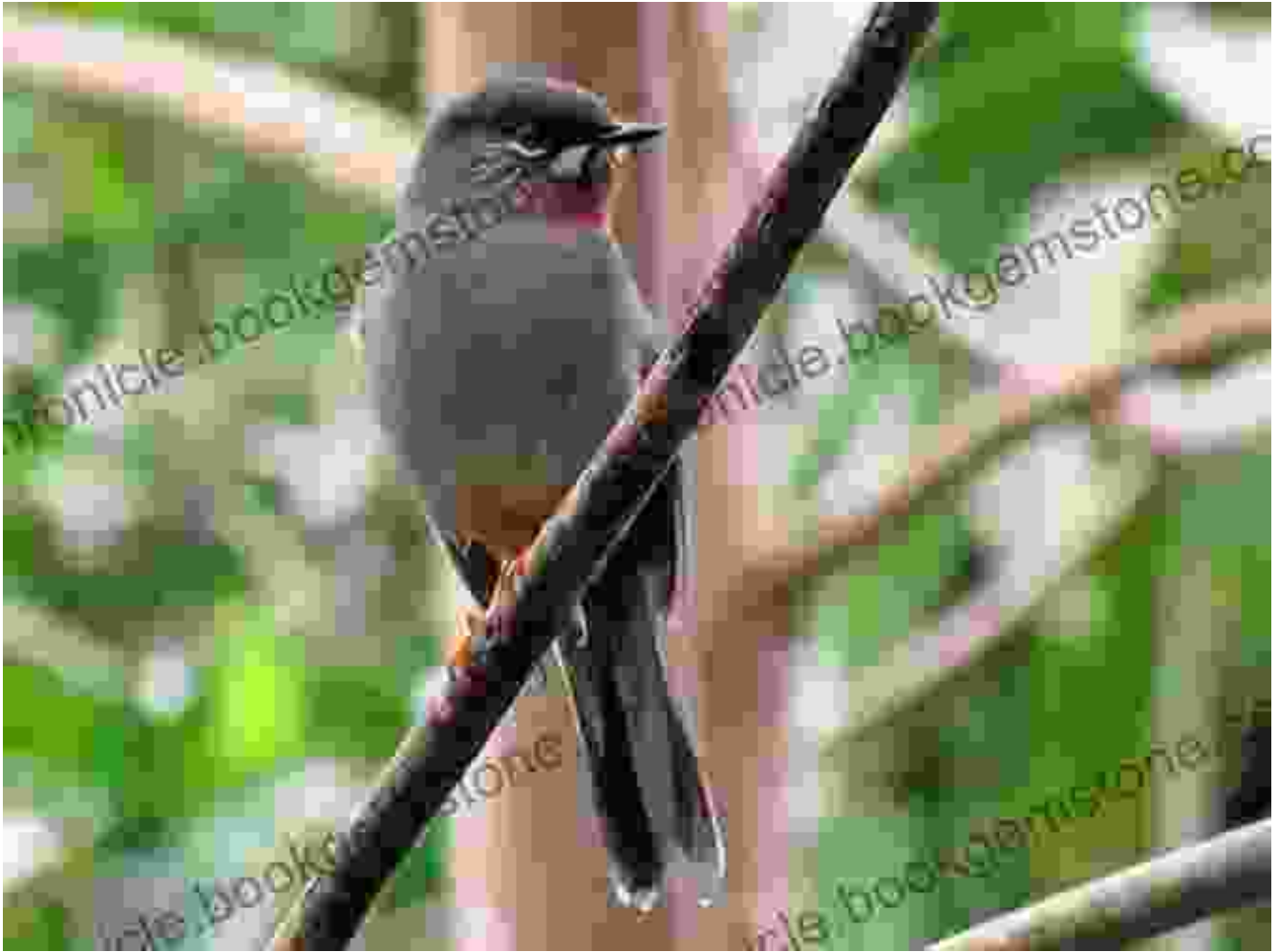
Rufous-Throated Solitaire, a shy and elusive inhabitant of Grenada's rainforests