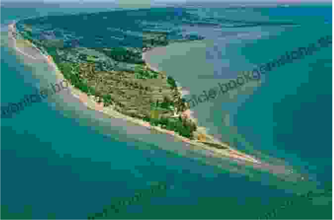
Long Point Provincial Park