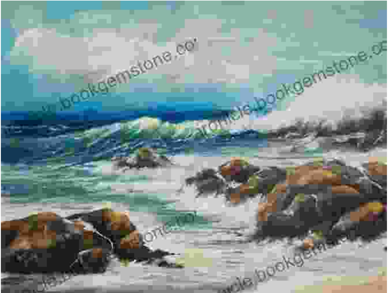
Oil painting of a stormy sea with crashing waves