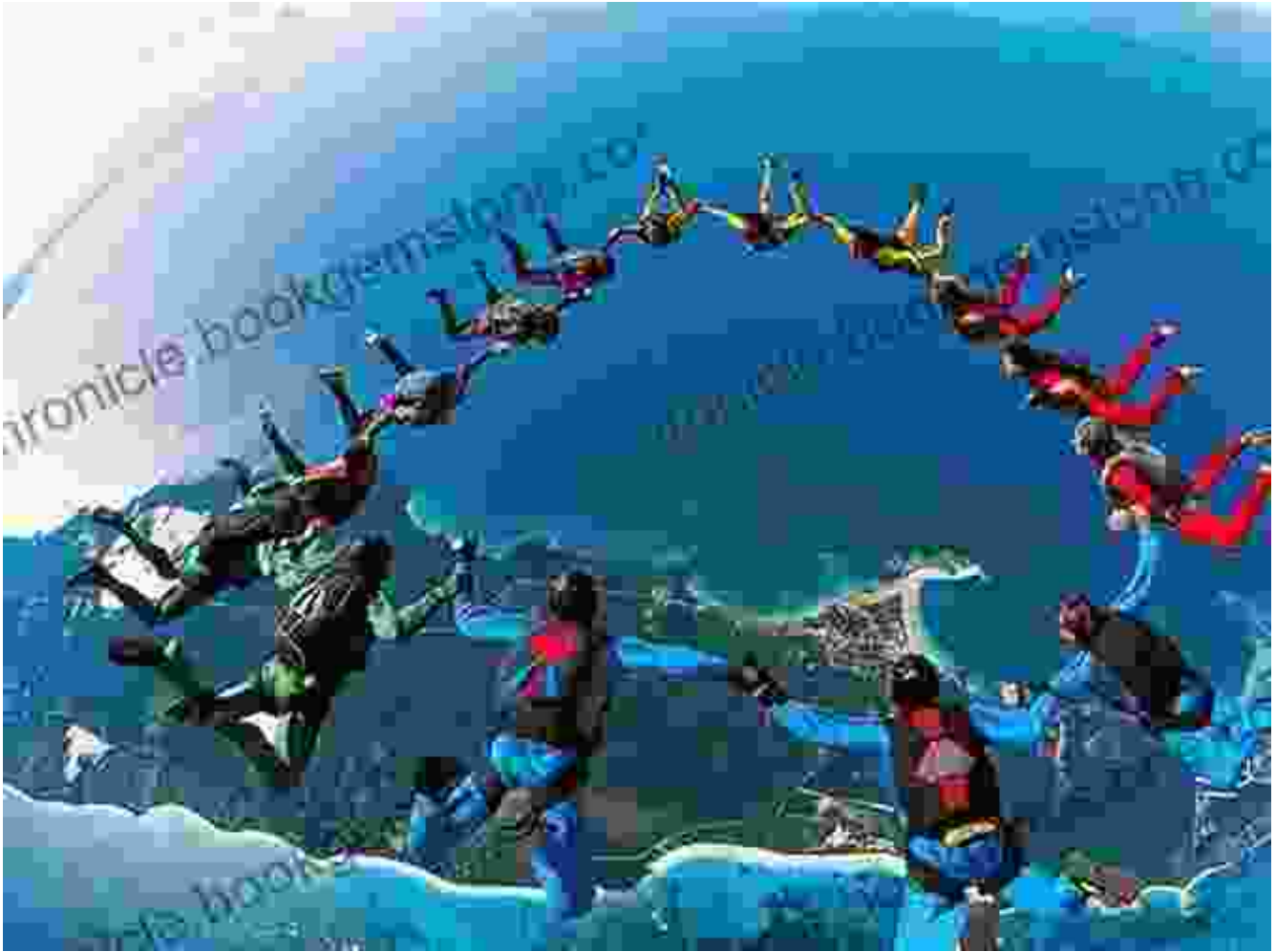
Skivvy skydivers in Australia