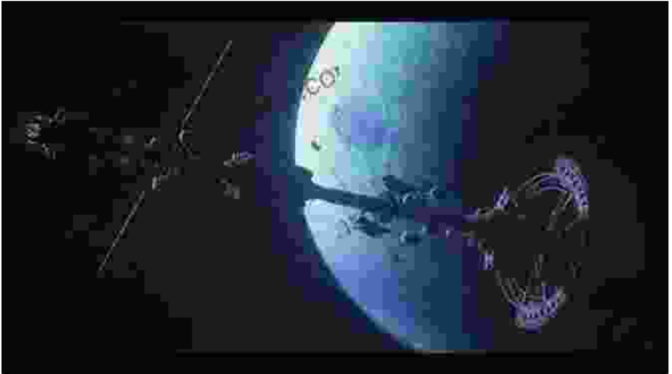
The Odyssey spaceship approaches the planet Aurelia