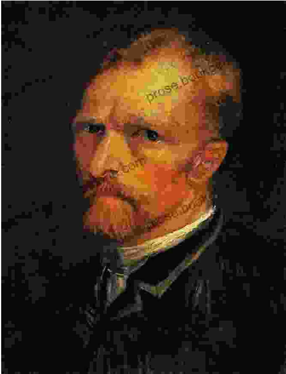
Self-portrait by Vincent van Gogh, 1889

power of art. It is an experience that will undoubtedly enrich the lives of all who undertake it.