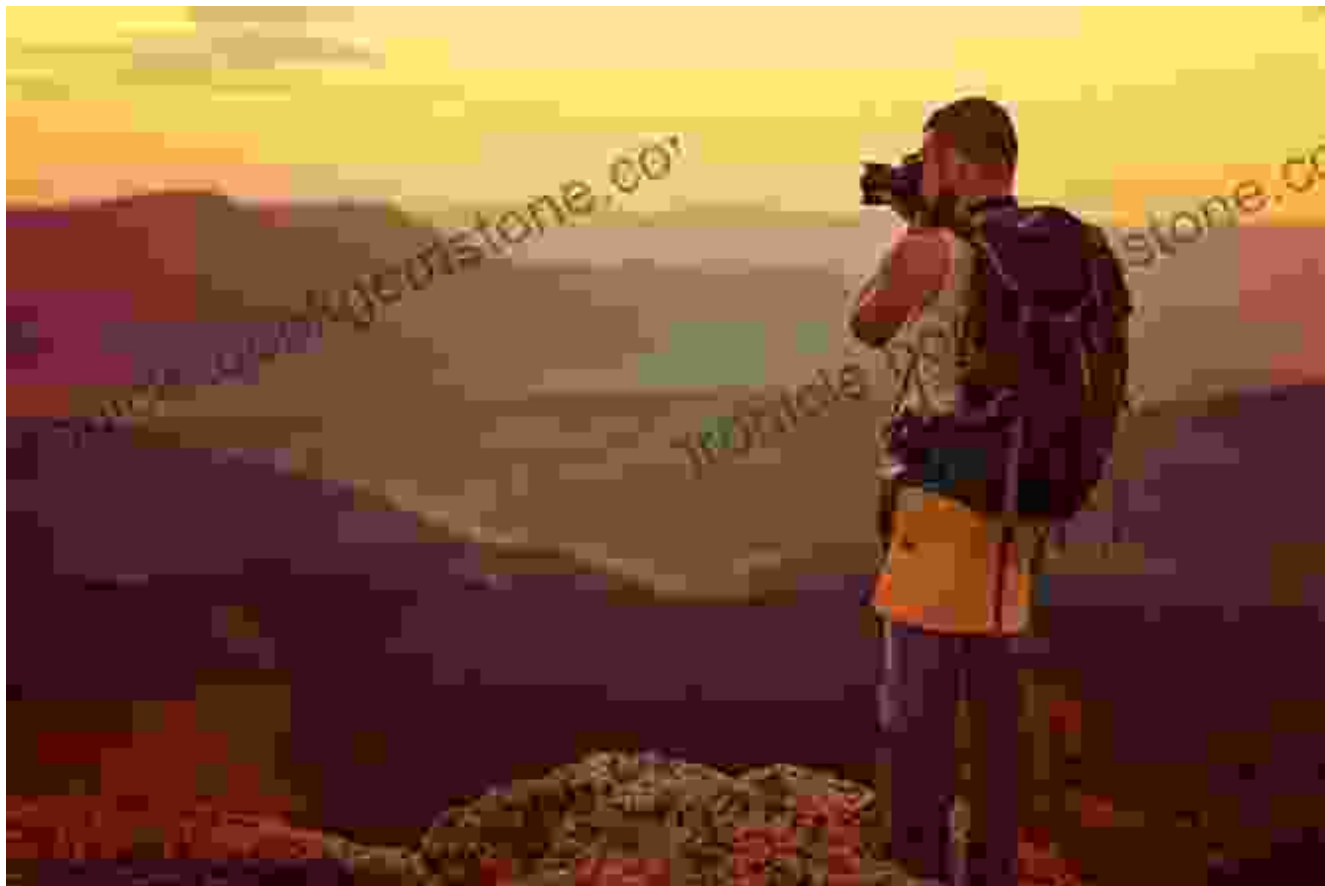
Photo Travel Guide to Photo Shot Spots Using Google Maps: Locating from Cairo to...