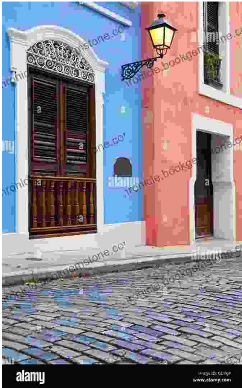
Colorful buildings in San Juan